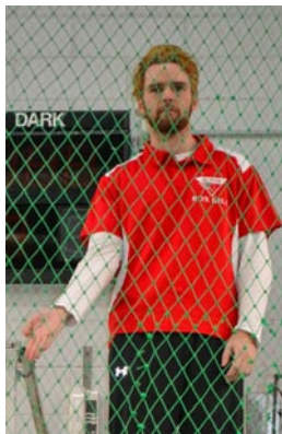
Bowler Changing Sides